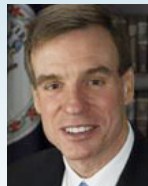
Senator Mark Warner