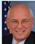
Congressman Paul Tonko