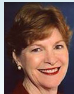
Senator Jeanne Shaheen