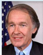
Congressman Edward Markey